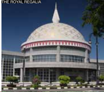
THE ROYAL REGALIA