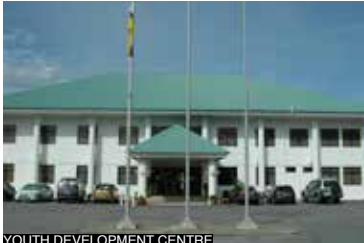
YOUTH DEVELOPMENT CENTRE