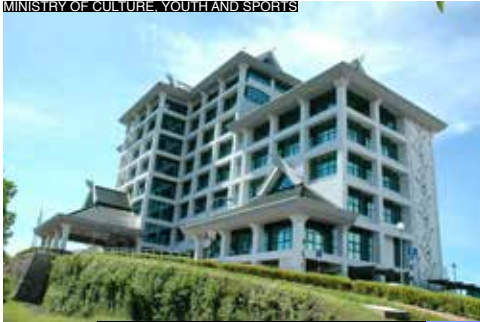
HASSANAL BOLKIAH NATIONAL SPORTS COMPLEX