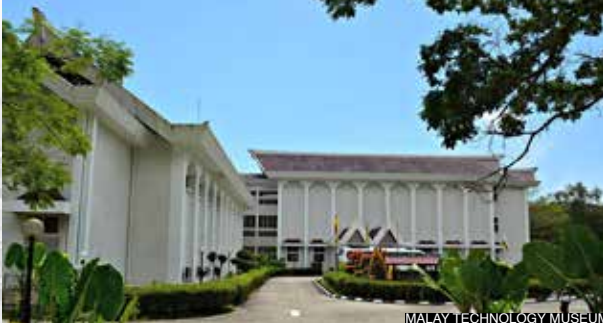
MALAY TECHNOLOGY MUSEUM