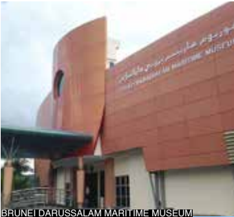
BRUNEI DARUSSALAM MARITIME MUSEUM