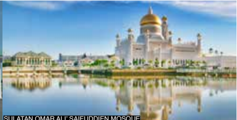
SULTAN OMAR ALI SAIFUDDIN MOSQUE