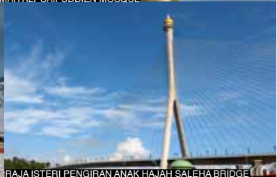
RAJA ISTERI PENGIRAN ANAK HAJAH SALEHA BRIDGE