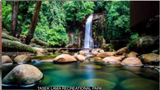
TASEK LAMA RECREATIONAL PARK