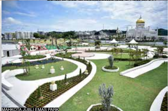
MAHKOTA JUBLI EMAS PARK